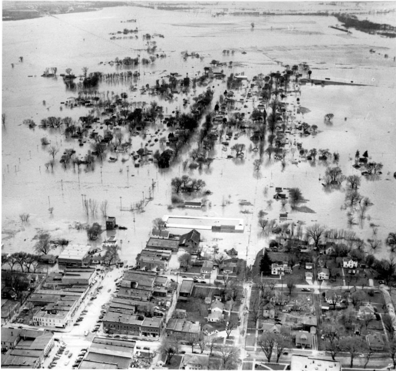
Figure 16. Floodwaters inundate portions of Council Bluffs, Iowa in April 1952.