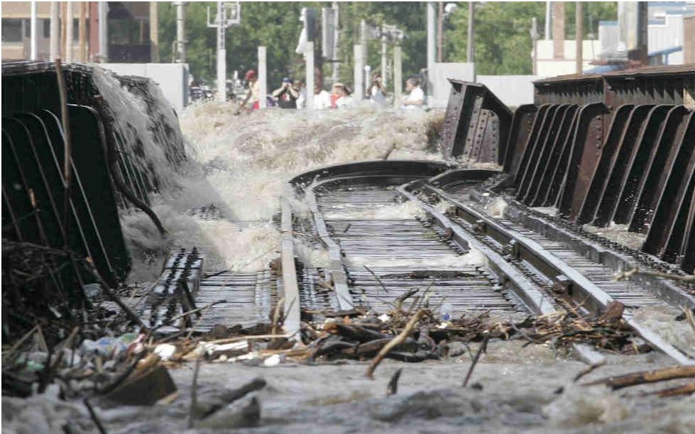
Figure 7. A railroad bridge is partially swept away by Cedar River floodwaters in downtown Waterloo, Iowa on June 10, 2008 as some people on the opposite river bank look on.