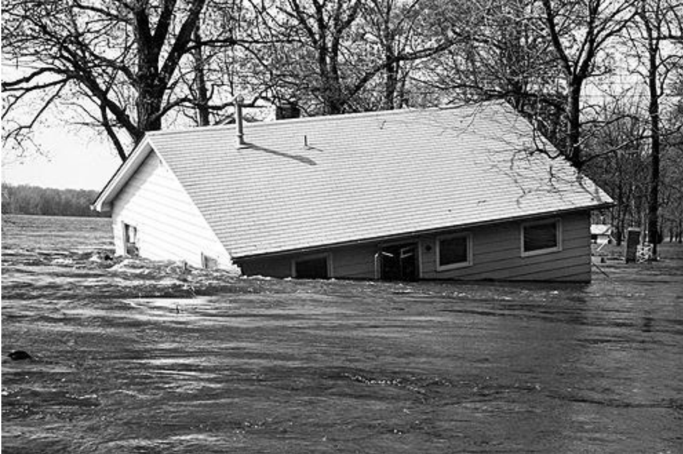
Figure 13. Floodwaters from the Mississippi River sweep away a house near Davenport, Iowa in April 1965.