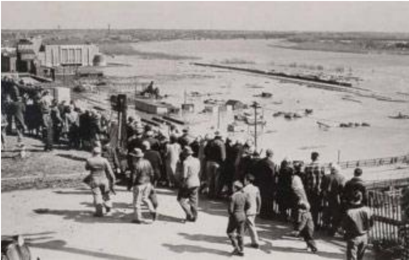
Figure 15. People observe flooding along the Missouri River in Sioux City, Iowa in April 1952.