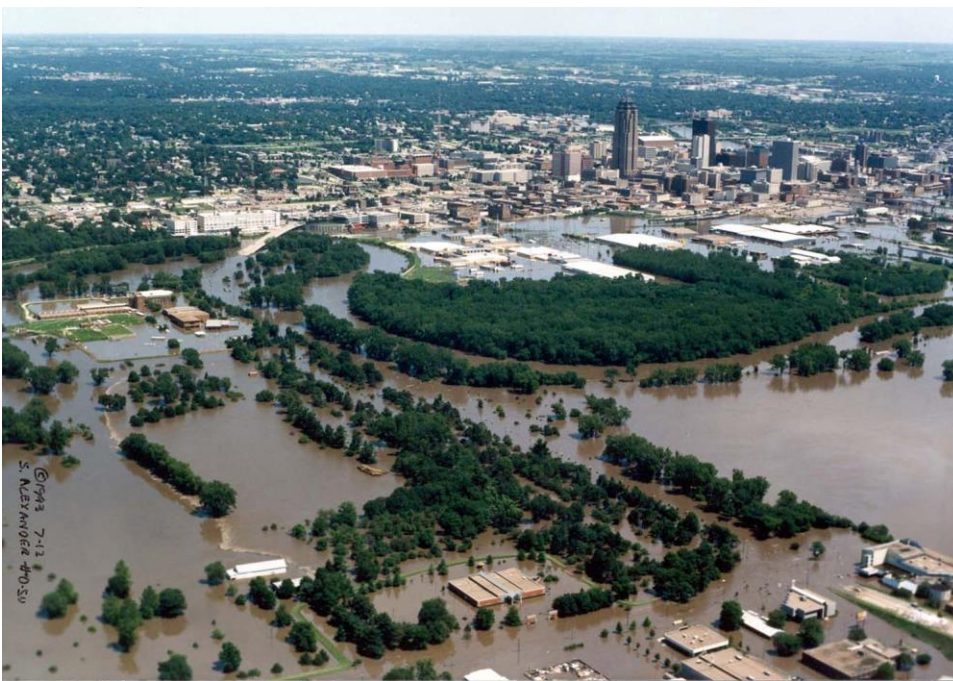
Figure 2. Floodwaters from the Raccoon River inundate downtown Des Moines, Iowa and Des Moines Water Works on July 11, 1993.