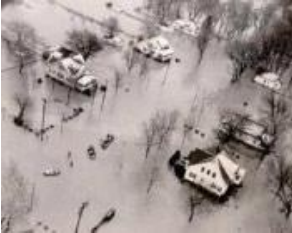
Figure 14. Floodwaters inundate a neighborhood in the Sioux City, Iowa area in April 1952.