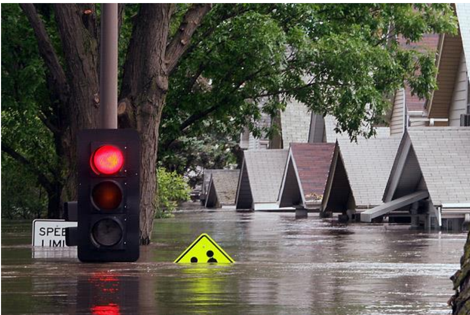
Figure 5. The Cedar River floods a neighborhood in Cedar Rapids, Iowa in June 2008.