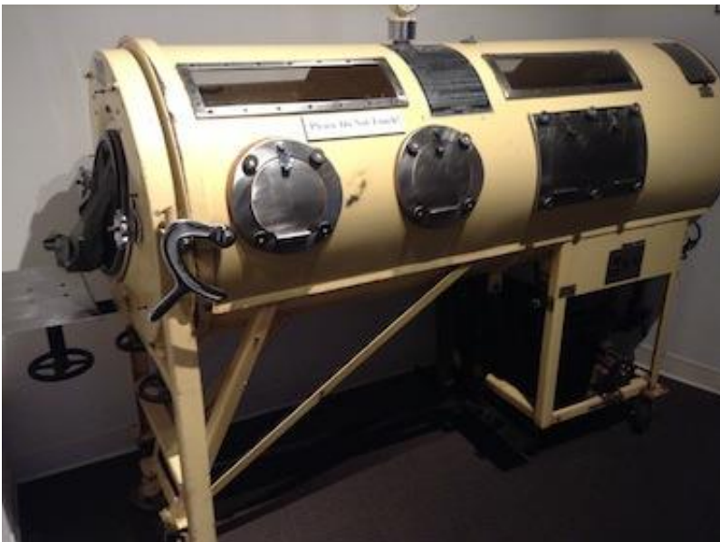
Figure 17. Iron lung used to treat polio patients at St. Vincent Hospital in Sioux City in 1952.