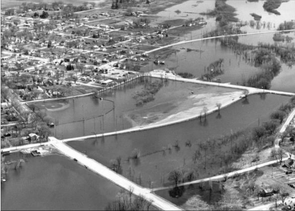
Figure 11. Floodwaters from the Mississippi River affect portions of Clinton, Iowa in April 1965.