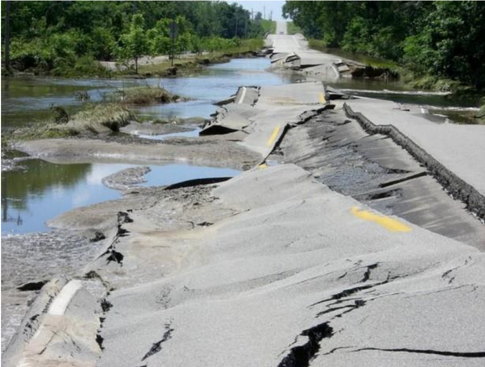
Figure 8. Significant damage to U.S. Highway 6 becomes apparent after the Cedar River subsides east of Atalissa, Iowa in June 2008.