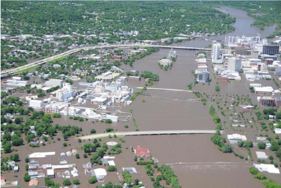
Figure 4. Downtown Cedar Rapids, Iowa on June 13, 2008 as the Cedar River crested more than 11 feet above its previous record.