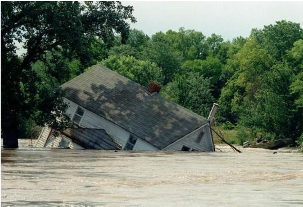
Figure 3. A two-story house across the Iowa River from Wapello, Iowa was knocked off its foundation after a levee broke in early July 1993.