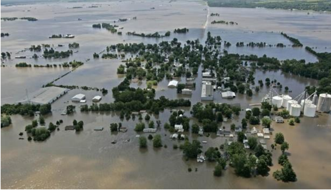
Figure 6. Flooding from the Iowa River inundates the town of Oakville, Iowa after a levee failed on June 14, 2008. Nearly every building was damaged by the six feet of water which rushed into town.