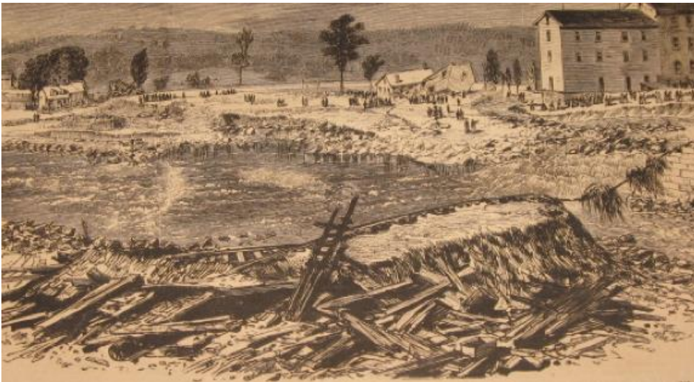
Figure 9. Antique woodcut engraving titled “Iowa-The Disastrous Flood at Rockdale on the Night of July 4th-5th. Scene Near the Dam the Morning After the Storm.” From a Sketch by A. Simplot. This photo was published in Frank Leslie's Illustrated Newspaper on July 29, 1876.