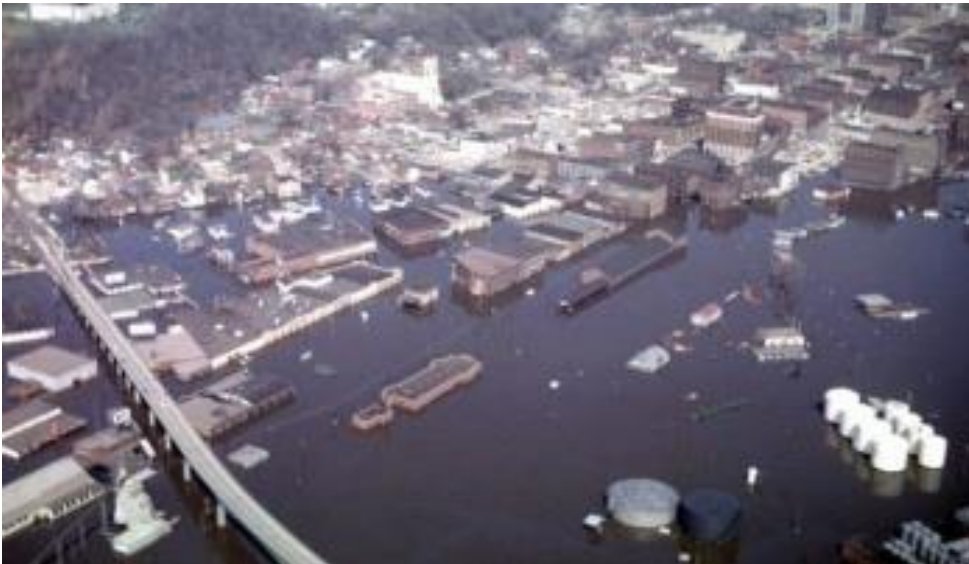
Figure 10. Floodwaters from the Mississippi River inundate downtown Dubuque, Iowa in April 1965.