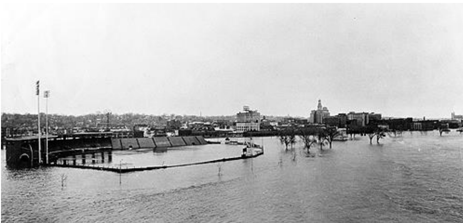
Figure 12. Floodwaters from the Mississippi River inundate downtown Davenport, Iowa and John O'Donnell Stadium in April 1965.